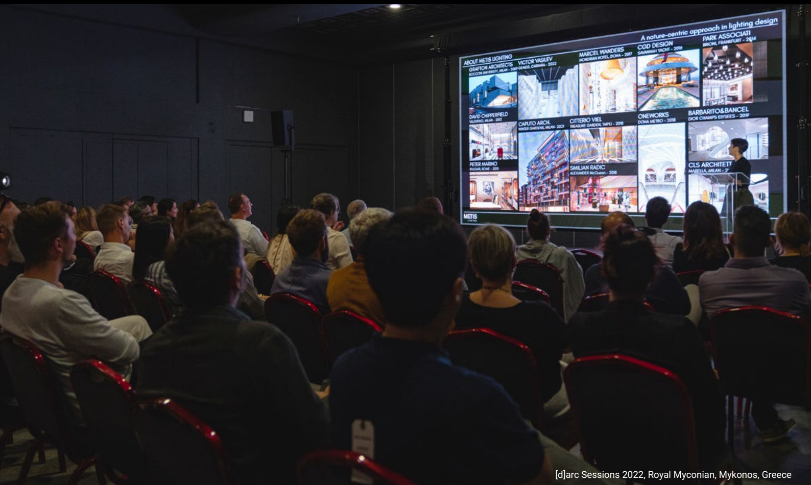
[d]arc Sessions 2022, Royal Myconian, Mykonos, Greece