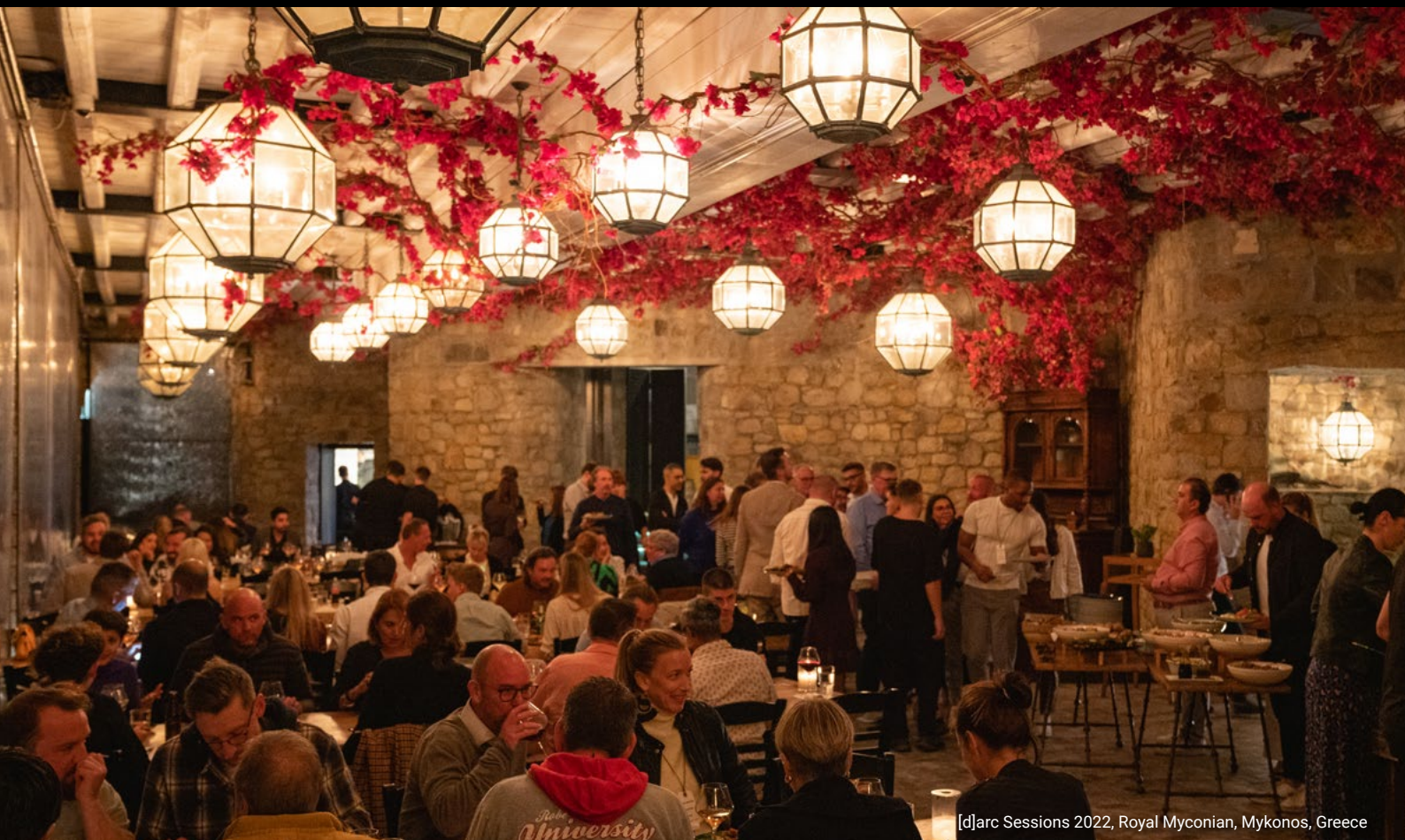
[d]arc Sessions 2022, Royal Myconian, Mykonos, Greece