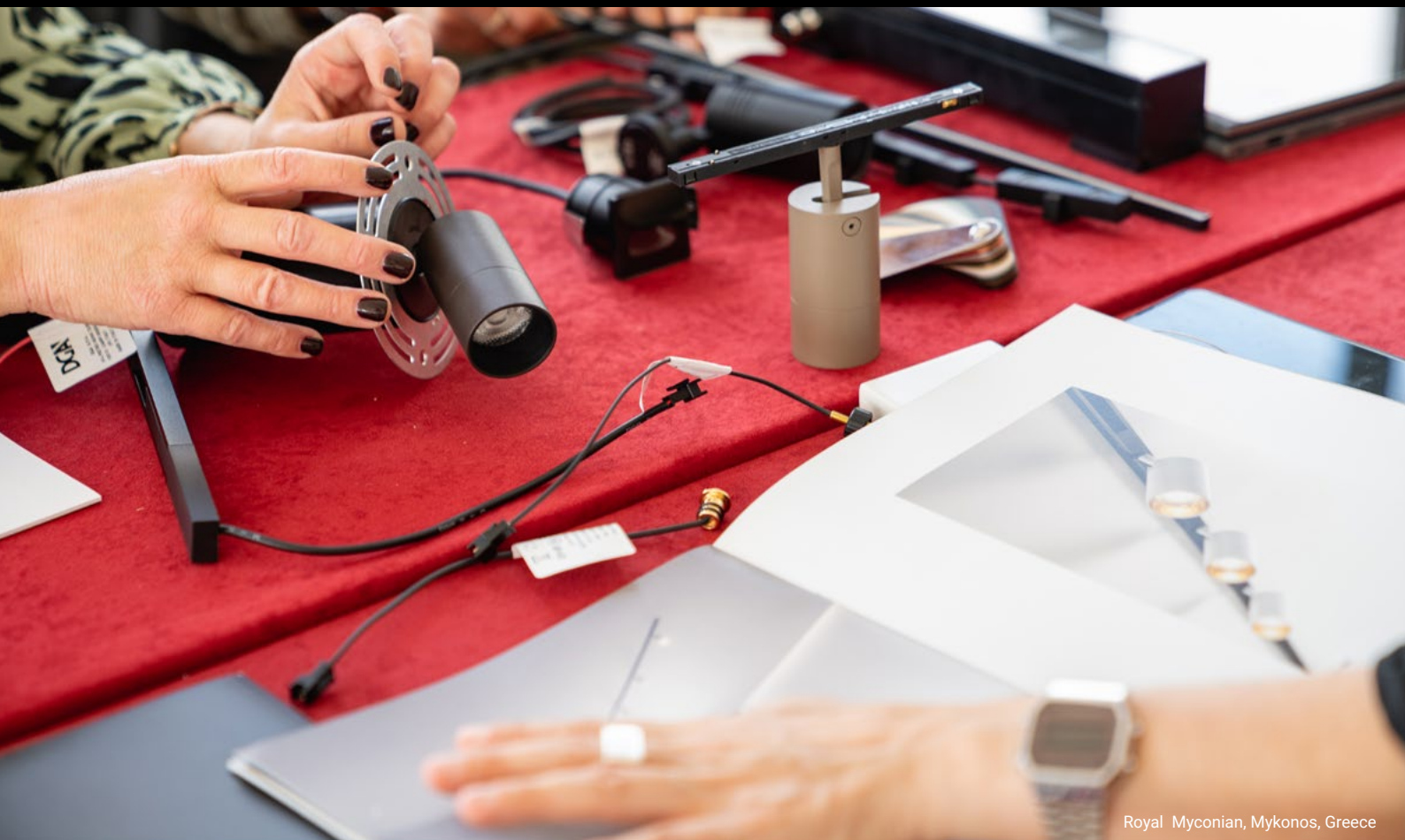
Royal Myconian, Mykonos, Greece